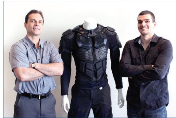
IFTech (Inventing Future Technology Inc.)