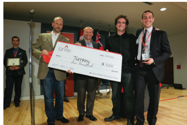
Turnkey Aquaponics Solutions