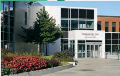
| Oshawa City Hall