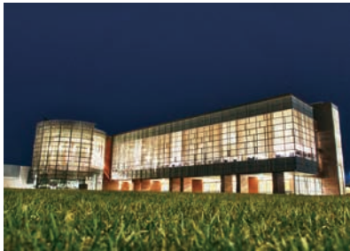
| Campus Library

The University of Ontario Institute of Technology (UOIT) is one of the youngest and fastest growing universities in Canada. From the start, we integrated our campus and curriculum into the fabric of Durham Region, as well as into many other communities around the world. We believe creative infrastructures builds smarter communities. We focus on innovation and strive to educate students through a combination of research, hands-on learning and intensive community involvement.