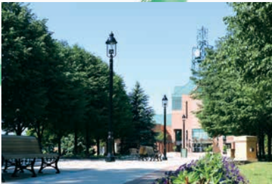
| Pickering City Hall

It is a privilege and honour to be part of the Durham Region and Northumberland County community. We are proud of the contributions we make and our social and economic impact.