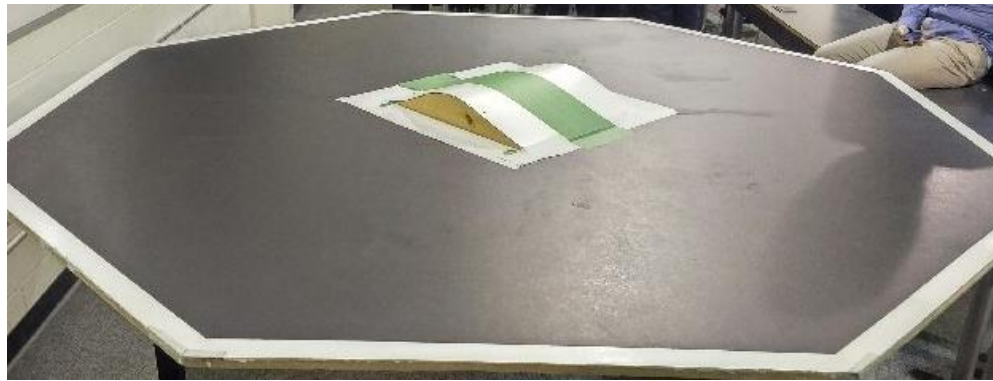
Figure 1: The octagonal Sumo ring. Note that netting will be added to catch SumoBots.

Figure 1 shows a six-sided Sumo ring. The Sumo ring is a hexagon or octagon that is approximately 96" from edge-to-edge, with each edge 40-41" in length. The table is painted black with a 1 1/2 - 2" white stripes denoting the edge of the table. In the middle of the competition area is ramp that is approximately 1 1/2" (one-and-a-half inches) in height and 18" from edge-to-edge. The boarder of the ramp is marked by a 4" white stripe. The ramp has an approximately 7 1/2:" green stripe down the middle as a guide line. Note that this is Rona-brand green painters tape.