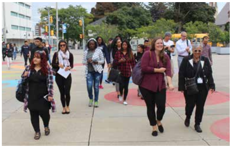
Several classes participated in a bus tour, which took them to key locations within the city related to their particular challenge question and to City Hall.

In City Idea Lab classes, students received a presentation from City staff, which overviewed the services provided by local government, Oshawa's demographics and provided context to the challenge question the students were working on during the semester.