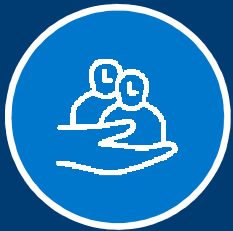
Tim McTiernan Mentorship Award