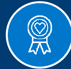
UOIT Student Choice Awards