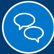
UOIT Teaching Assistant Excellence Award