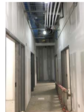
1 st floor Offices