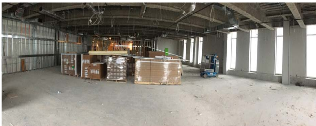
2 nd floor Classroom