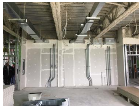
2 nd floor Lab