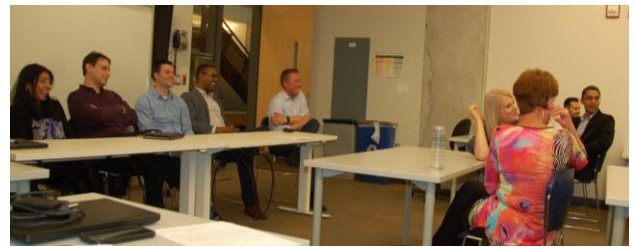
FESNS Alumni participating in a panel

Time Flies! 2017 marks a decade of graduating students from UOIT's undergraduate programs. The Faculty of Energy Systems and Nuclear Science invited all graduates from its first graduating class to come back on campus to celebrate. When these students started at UOIT, there was only half of the UA building. A tour of the additional campus facilities helped solidify how far we've come since these students began in 2003. Along with the tour, the evening also included an alumni panel and time to mix and mingle with Faculty, staff, and fellow graduates.