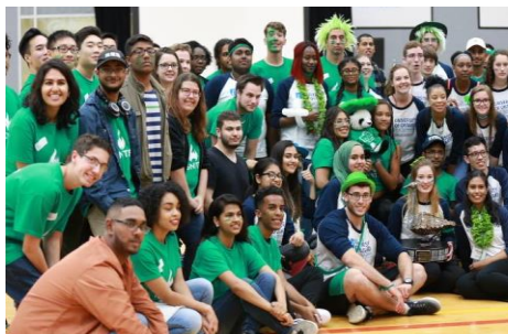
Science wins the coveted Stanley Trophy

This year saw over a thousand incoming students all cheering in their Faculty colours. There were over 130 peer orientation leaders on hand to guide these enthusiastic students to making their mark on campus. The yearly fight for the Stanley trophy was won by the Faculty of Science.