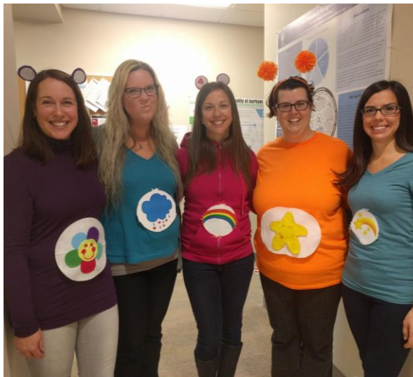
FSSH Academic Advising Team show their "CARE A LOT" community in their Care Bear Team Costume.