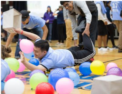
Orientation Fun & Games