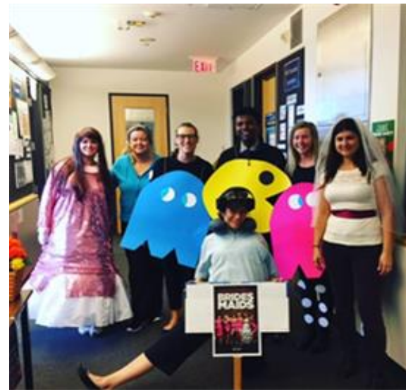
FBIT Advising Team in Bridesmaid Movie Characters and FEAS Advising Team as Pac Man.